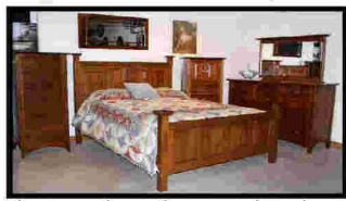
design | craftsmanship | vision